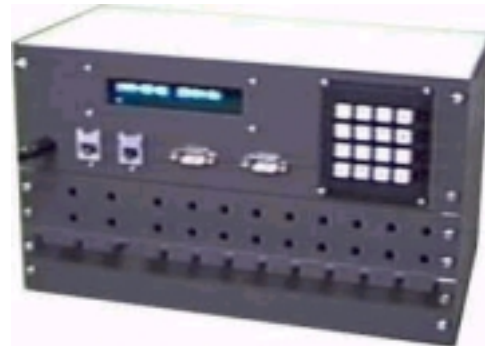
MCC-B3 -911 MASTER CLOCK SYSTEM